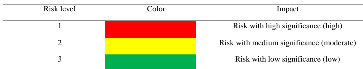
Table 5 Classification of risk/opportunity (expert views)